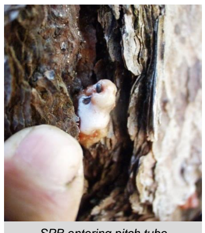
SPB entering pitch tube

Eradication of this pest is not feasible because it is widespread, moves quickly, and is present in neighboring states. As a result, forest health management conducted by the State is focused on protecting the large forested blocks and unique habitats, such as the Core Preservation Area of the Long Island Central Pine Barrens. Management efforts include aerial and ground surveys, cutting infested trees, and thinning uninfested trees. So far, more than 8,000 trees have been cut in the Core Preservation Area in suppression efforts to slow the spread of SPB and protect surrounding trees.