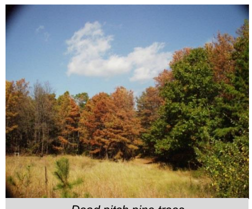
Dead pitch pine trees